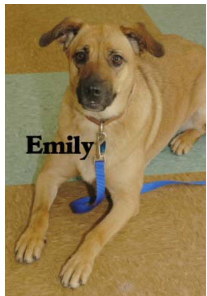
Emily, awaiting her adopter.

Return for $3.00 off any Wellness Product