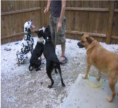
Learning to play together.