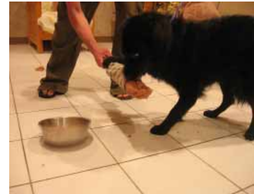
Put this guy in our food training program!