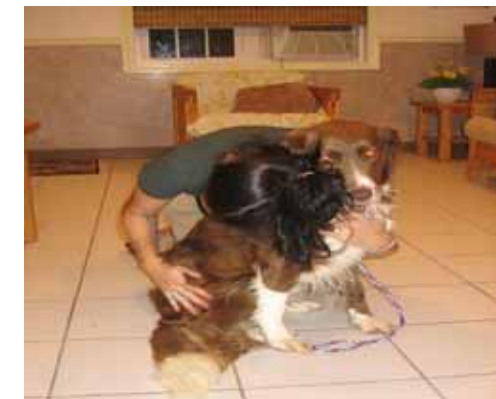
Is this a good dog for a house with children?