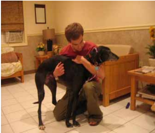
Safe hug test.