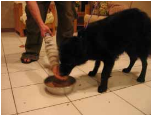
Food aggression Test.