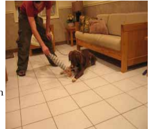
Treat aggression test.