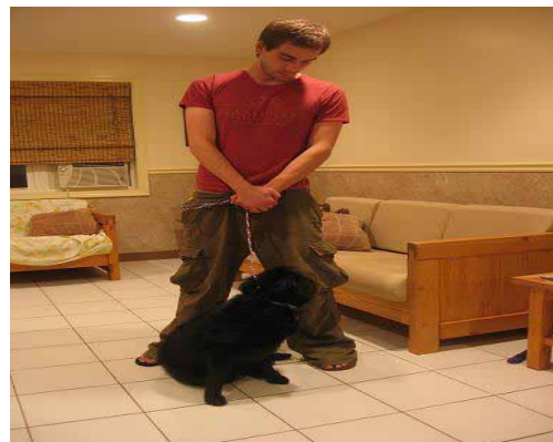
How long will it take for him to acknowledge the trainer?